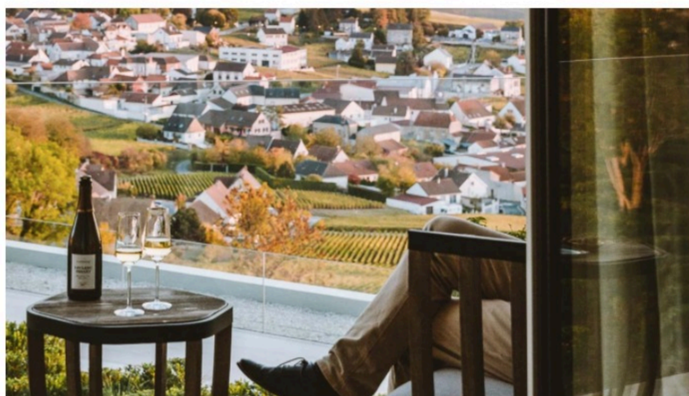
007 Royal Junior Suite, Royal Champagne Hotel & Spa

Before enjoying a starred dinner in Le Royal restaurant, however, guests will be invited to choose to enjoy Bond's favorite cocktails at the bar: the Vesper or the Dry Martini, shaken and not stirred, of course.