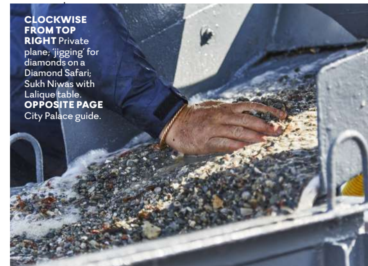
CLOCKWISE FROM TOP RIGHT Private plane; 'jigging' for diamonds on a Diamond Safari; Sukh Niwas with Lalique table. OPPOSITE PAGE City Palace guide.

Black Tomato can arrange tailor-made 10-day itineraries in Rajasthan including the City Palace experience from about $17,800 per person (based on group of four) excluding international flights. www.blacktomato.com .