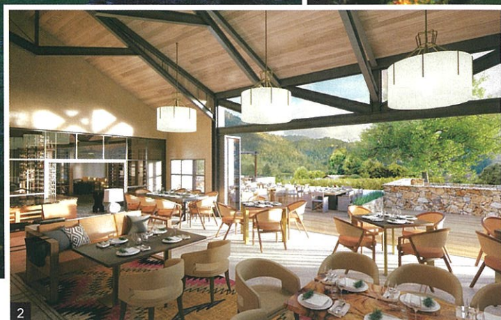
1 Cloudy Bay's tasting shed 2 Four Seasons Resort, Napa Valley 3 Ripe French vines 4 Devon's Lymstone Manor 5 Château Lafaurie-Peyraguey in Sauternes 6 Sicily's Tasca d'Almerita

Wine and wanderlust have long gone hand in hand. Now a fresh crop of hotels, retreats and tasting rooms offer oenophiles the chance to get straight to the heart of the action.