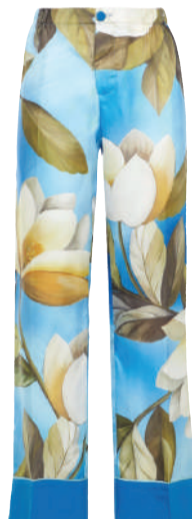
Floral-print silk-twill straight-leg pants, €160 www.theoutnet.com .