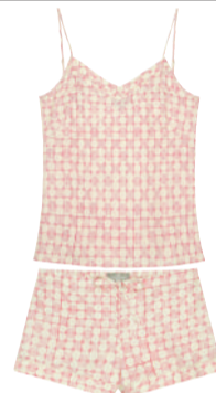
Pink Jaipur camisole set, €120; www.theethicalsilkco.com .