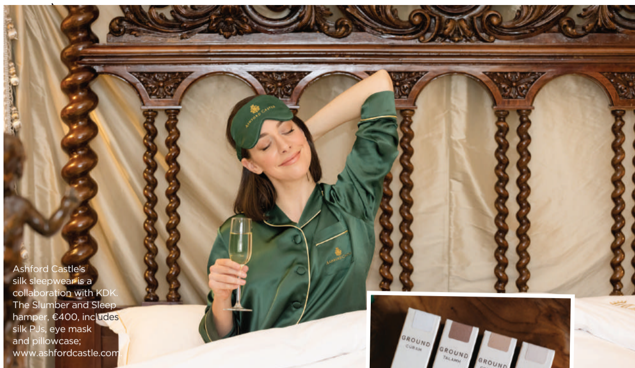
Ashford Castle's silk sleepwear is a collaboration with KDK. The Slumber and Sleep hamper, €400, includes silk PJs, eye mask and pillowcase; www.ashfordcastle.com