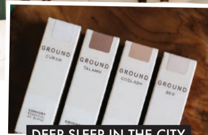
DEEP SLEEP IN THE CITY