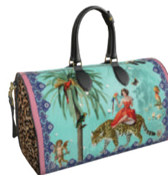
Turquoise Mary leather duffel bag, €895; www.myrtleandmary.com .

The Shelbourne hotel has joined forces with Peigin Crowley's Ground Wellbeing to create an exclusive Sleep Ritual (from €165, 60-minutes), a supremely relaxing full-body treatment that involves a LOT of warm aromatherapy oils being massaged into your skin. It's soporific and deeply restorative, and the beautiful surroundings are a bonus. Even better - upgrade in a most lavish way and book the Fall in Love with Sleep escape, which adds dinner and an overnight at the hotel - don't miss pre-dinner cocktails in the classy 1824 bar - plus a yoga class in the Health Club before breakfast. You can swim too (from 6am), in the quiet pool, a hidden gem in the heart of the city. Sink into a life of luxury for 24 hours and emerge feeling vastly rested. From €850; www.theshelbourne.com . SH