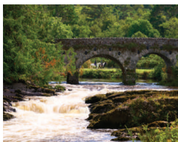
Sheen Falls Lodge, from €335 for two people sharing; www.sheenfallsdodge.ie .

frankincense, designed to soothe, nourish and send to sleep. Personally, I find I sleep better in any hotel where I can open a window and get fresh air. At Sheen Falls Lodge, the "white noise" is of its waterfalls, a natural sedative that is sadly difficult to replicate at home ... ■