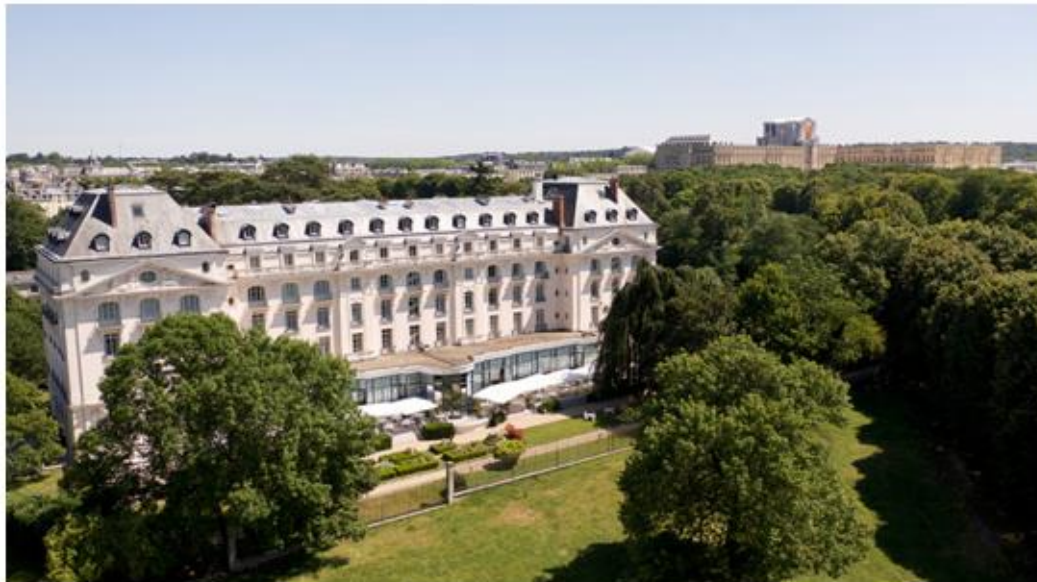
Waldorf Astoria Versailles – Trianon Palace.

Every season in Paris has its charm, and while winter sparkles with twinkling lights lining the city's iconic boulevards, there are only so many cafés and museums you can steal away to when the weather takes a turn for the worse. After spending a few days in the French capital, break up your visit with a quick jaunt to one of the postcard-worthy towns scattered across the countryside.