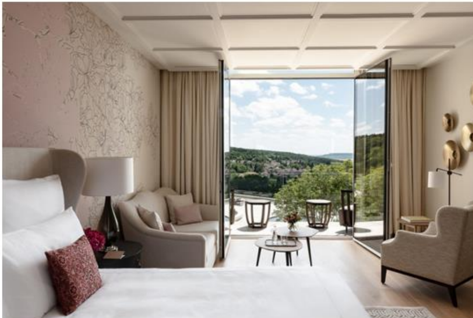
Royal Champagne Hotel & Spa.