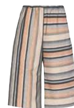
ROSETTA GETTY Jacquard shorts, £534. rosettagetty.com