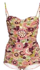
DODO BAR OR Tatiana ruched swimsuit, £230. matchesfashion.com