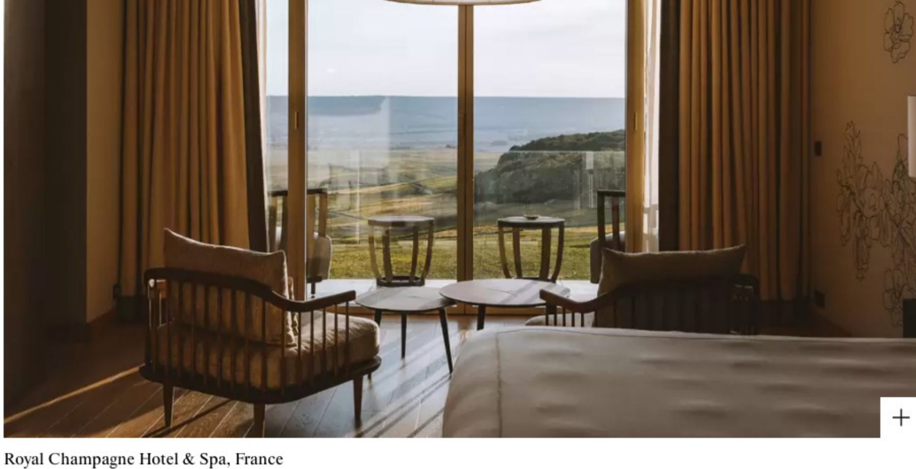
Royal Champagne Hotel & Spa, France

For a complete change of scenery without the long-haul flight, where better to head than our southern neighbour France, with its lush countryside and ample supplies of wine and cheese (tis the season, after all). Cosy up in Champagne country at this smart hotel in Epernay, where you can go for a sunset bike ride through the vineyards once you've downed tools for the day. With unlimited pastries, room service lunch and chic salons available to rent simply to impress your next Zoom caller, la vie est belle en France . royalchampagne.com