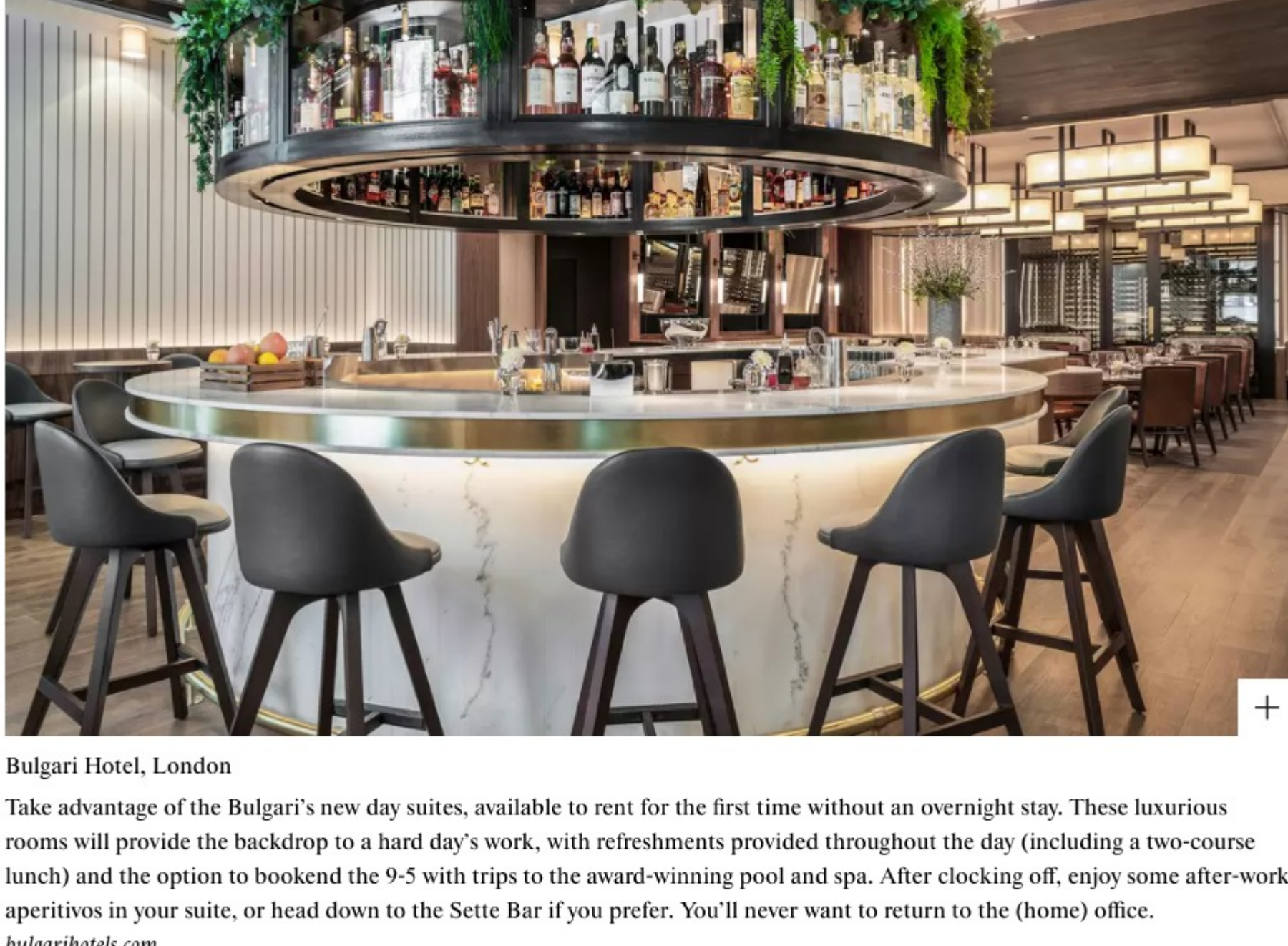
Bulgari Hotel, London

Ever since Barbadian president Mia Mottley announced that visitors could apply for a year-long 'work from home' visa, we've been dreaming of how we might set-up our own offices in the Caribbean paradise. Enter: Cobblers Cove. The so-called 'Dowager Duchess of the West Indies' is offering special rates for extended stays, with free laundry, a daily mini-bar restock and a personal maid service all thrown in, too. The best bit? Seeing how green with envy your colleagues are at the white-sand, turquoise-ocean backdrop. cobblerscove.com