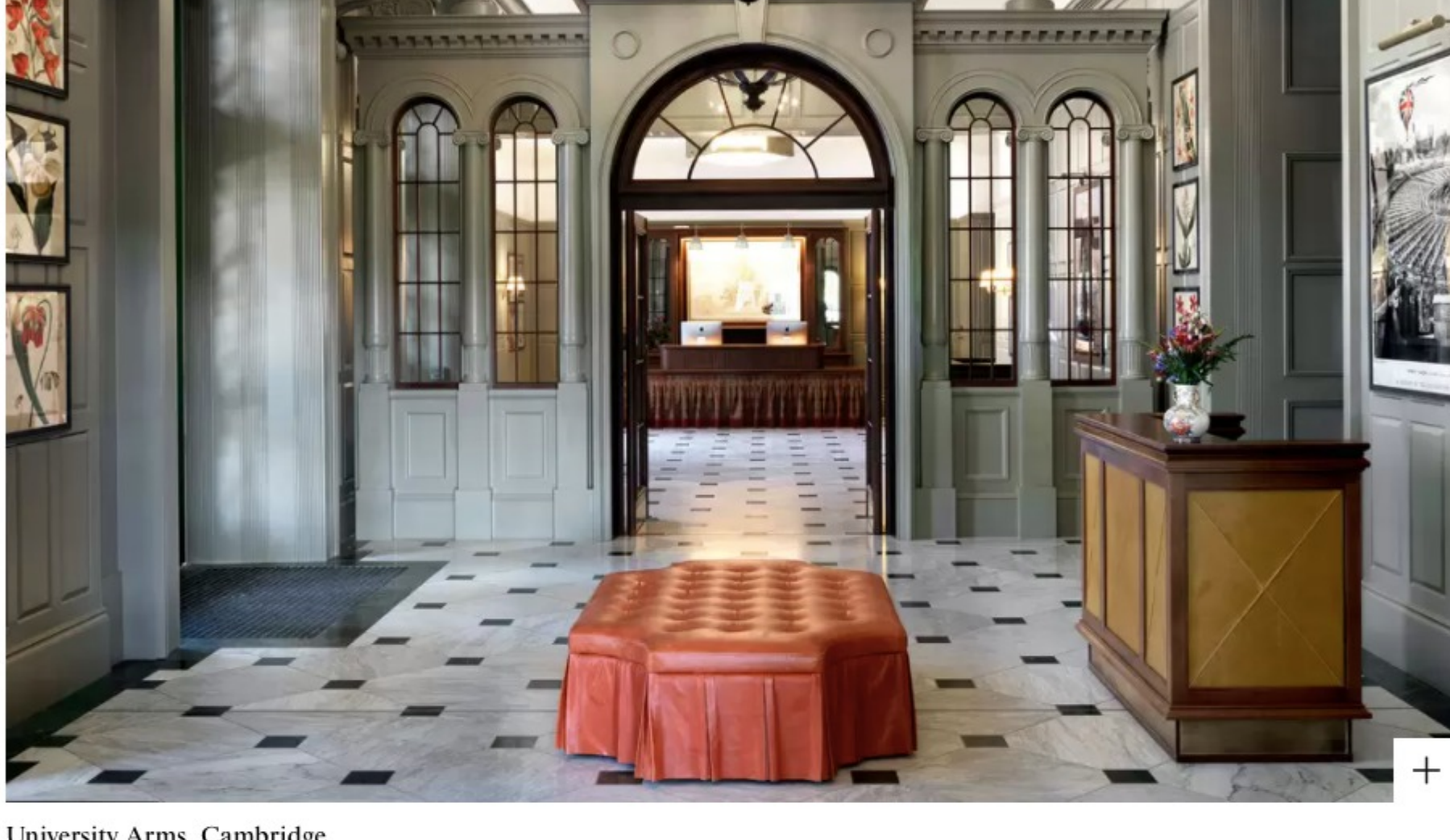
University Arms, Cambridge

Be inspired by Cambridge's academic splendour and hire a suite at the University Arms for the day. Available to use between 9am and 6pm, each suite has been transformed into a smart office space, with desk views overlooking Parker's Piece. The Nespresso coffee machine is probably an upgrade on your woeful brewing abilities chez-vous, and with access to the gym, too, there's no excuse to miss your workout, either. Lunch should be ordered from Parker's Tavern - who do delicious hot bento boxes complete with pudding - or head down and eat in the restaurant instead if you need a change of scene. The best bit? 'Creative Hour', when a gin and tonic appears at your door as if by magic. That'll get the ideas flowing... universityarms.com