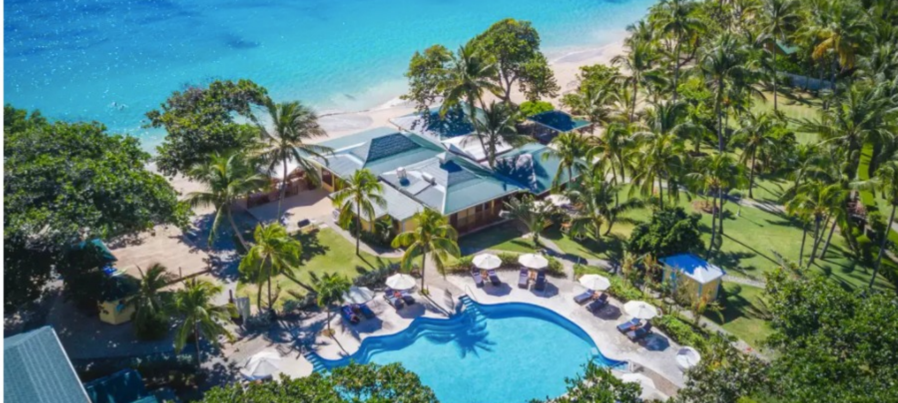
Bequia Beach Hotel, Bequia

This 18th century Palladian pile is the perfect spot from which to work remotely, particularly when you factor in its roaring fireplaces, comfy antique sofas and numerous cosy corners from which to settle down with a laptop and a pot of tea (available on a complimentary basis all day). Situated in 500 acres of beautiful countryside, it's also the best spot if you have been keeping up those daily walks, and with an award-winning spa on site too, there's also time to fit in a pamper session. Offering three nights for the price of four, or five nights for the price of seven, it's a bargain too smart to refuse. lucknampark.co.uk