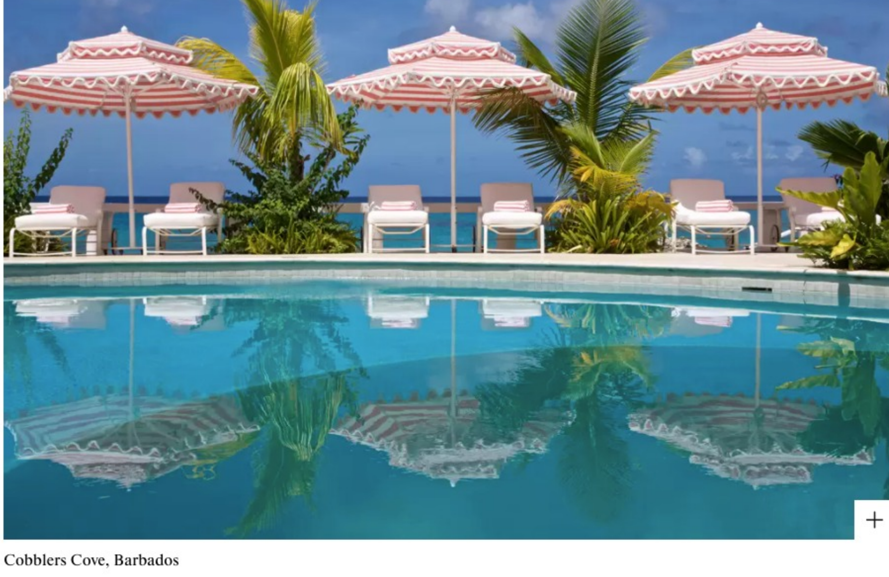
Cobblers Cove, Barbados

Ever since Barbadian president Mia Mottley announced that visitors could apply for a year-long 'work from home' visa, we've been dreaming of how we might set-up our own offices in the Caribbean paradise. Enter: Cobblers Cove. The so-called 'Dowager Duchess of the West Indies' is offering special rates for extended stays, with free laundry, a daily mini-bar restock and a personal maid service all thrown in, too. The best bit? Seeing how green with envy your colleagues are at the white-sand, turquoise-ocean backdrop. cobblerscove.com