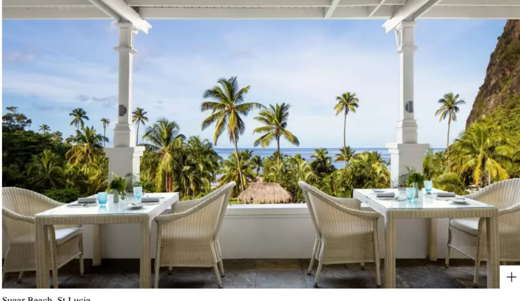
Sugar Beach, St Lucia

When you're next staying out the window, watching the rain, just remember you could be looking out at the UNESCO World Heritage-listed Pitons from your desk at the iconic Sugar Beach hotel in St Lucia. Its Work from Paradise package elevates the commute to a VIP round-trip, your intern to a private butler, and your Pret dinner to a 3-course supper. Other perks include private cabana access, a 50-minute Swedish massage, and not spending winter in the UK. vicroyhotelsandresorts.com