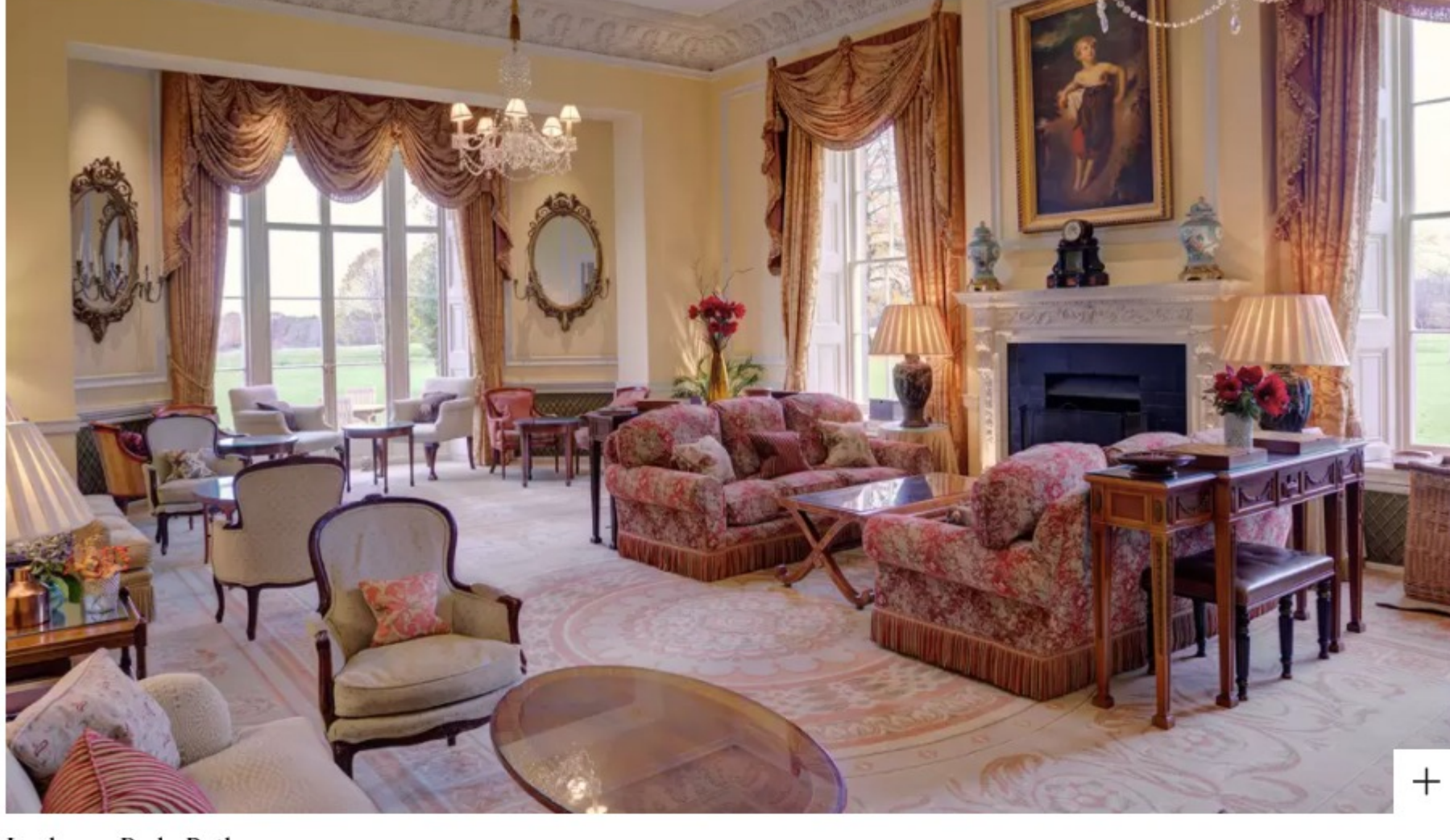
Lucknam Park, Bath

When you're next staying out the window, watching the rain, just remember you could be looking out at the UNESCO World Heritage-listed Pitons from your desk at the iconic Sugar Beach hotel in St Lucia. Its Work from Paradise package elevates the commute to a VIP round-trip, your intern to a private butler, and your Pret dinner to a 3-course supper. Other perks include private cabana access, a 50-minute Swedish massage, and not spending winter in the UK. vicroyhotelsandresorts.com