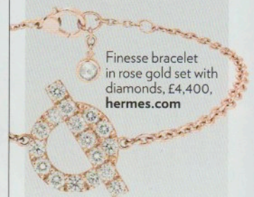
Finesse bracelet in rose gold set with diamonds, £4,400, hermes.com