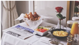
Hotel Review: Hilton Paris Opera September 3, 2018 In 'Bar'