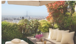
10 Best Rooftops in Paris August 13, 2014 In 'BEST OF PARIS'