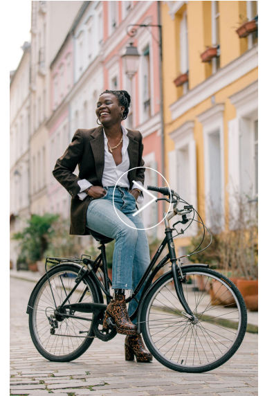
Some pretty cool videos of Paris - longer length over on Youtube