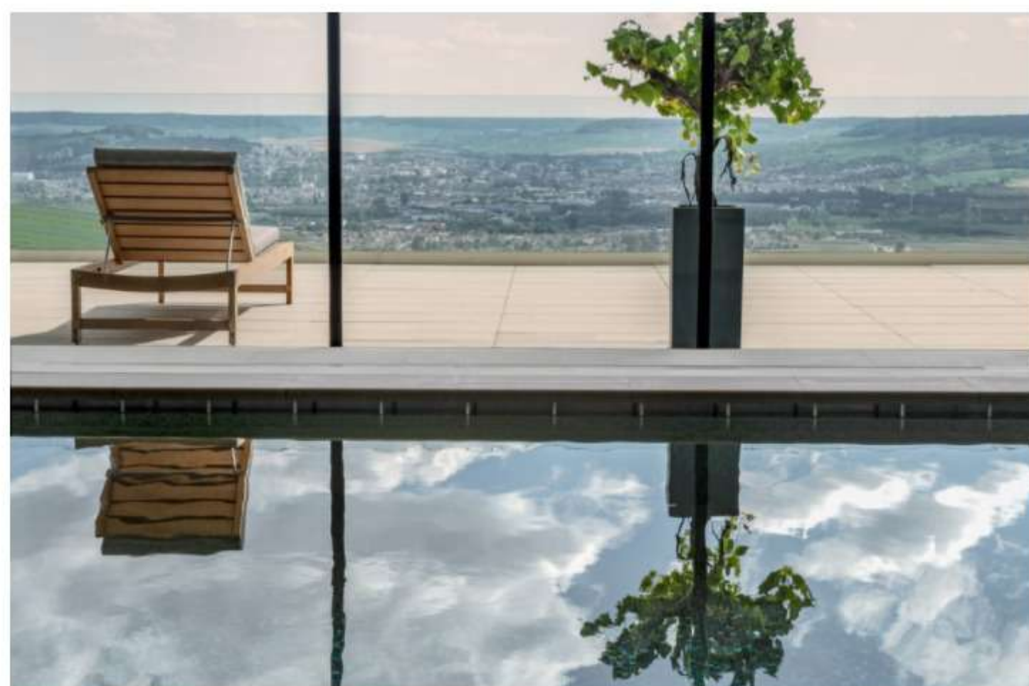
The Spa pool with views over the Marne Valley

When you've finished exploring the vineyards and cellars, the hotel offers plenty of options for rest and relaxation. The 47 rooms and suites – all with vineyard views – combine chic French style with luxury and comfort.