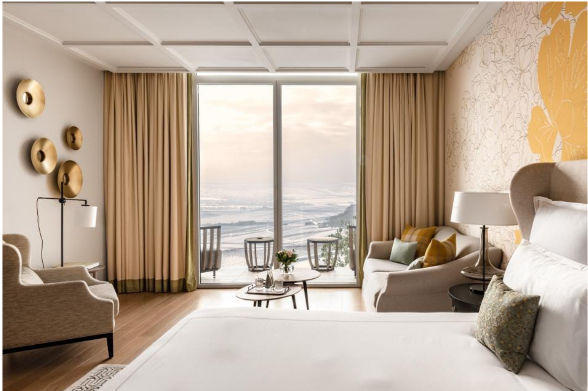
Inside the Royal Champagne Hotel & Spa in France. ROYAL CHAMPAGNE

With World Sleep Day on March 18 and National Sleep Awareness Week from March 13 in the U.S., luxury hotels around the world are hosting stays designed to help you get a better night's rest.