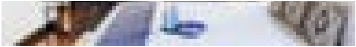
The Rest & Recovery Suite at Hotel Figueroa. TANVEER BADAL