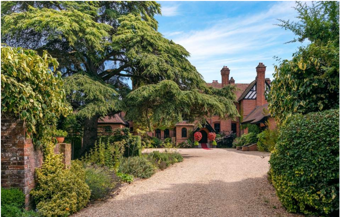
The entrance to Careys Manor Hotel.

for personalized in-suite wellness amenities and experiences. This one-bed residential-style suite overlooking the city and Central Park is outfitted with the sleep science backed and AI powered Restorative Sleep Technology bed helping guests combat jet lag, fall asleep more quickly and stay asleep longer as it dynamically adjusts to relieve pressure points and control the climate through the various stages of sleep. Other sleep enhancing amenities in this suite include a Vitruvi Essential Diffuser and signature Sleep essential oil blend, Nollapelli linens, sleeping masks and a collection of sleep-related books. A stay here also comes with access to the hotel's spa featuring a hydrotherapy area, saltwater lap pool, whirlpool and eucalyptus steam room, as well as fitness centre with equipment including Peloton.