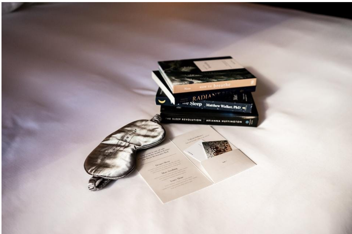
The Restorative Sleep Suite at Park Hyatt New York.

complete with nine cabins for Biologique Recherche treatments, indoor and outdoor swimming pools, a steam room, sauna and Jacuzzis, as well as fitness room, yoga studio and beauty bar. Now the hotel and spa is extending its wellness offering with the creation of the Royal Sleep Experience. This new program is the result of a new partnership with French beauty brand AIME and is designed to give guests a better night's sleep through the inclusion of AIME's sleep and glow set featuring a soothing essential oil spray and melatonin-based drops that aid sleep and ensure proper regeneration of the skin overnight, as well as an in-room meditation box, satin face mask, luxurious linens, a dedicated bedtime menu and a candle massage aimed at improving sleep quality. The 46-room property is just 45 minutes from Paris and celebrated for its Michelin-starred dining offering, vineyard views and Champagne Concierge arranging tastings at nearby Champagne houses.