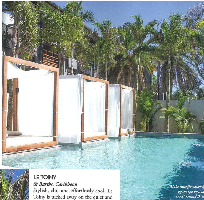
Make time for yourself by the spa pool at LUX* Grand Baie