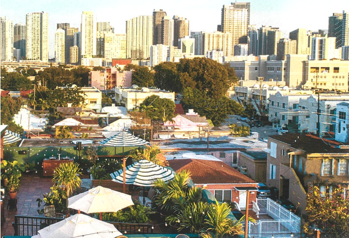
Postcard from the edge: the view across the Miami skyline from the rooftop bar at Life House, Little Havana