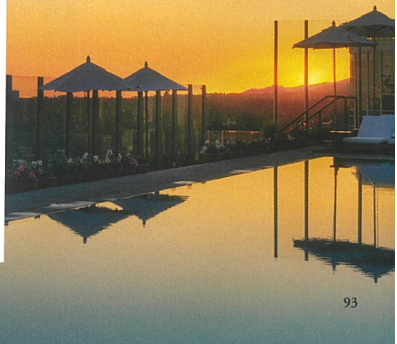
Join the cool crowd by the rooftop pool at The West Hollywood Edition in LA

As good as it gets in the LA-cool, rooftop-pool category. Top marks for its 'location-location-location': the hotel sits in a prime position on the border between Beverly Hills and hipster WEHO. But with its jaw-dropping decor, it is also an entertainment destination in itself. The tone is set in the soaring lobby, which features a Sterling Ruby mobile called 'The Scale', a bright-yellow pool table, striking emerald floor-to-ceiling curtains and plush velvet seating. And the magic continues in the signature restaurant, Ardor, a symphony of rich, dark wood, dripping in foliage. But dreamy interiors aside, the talking point at Ardor is the gooseberry phyllo pizza, featuring crème pâtissière and 25-year-old aged Balsamic. Meanwhile, the suites, serene eyries in the LA skyline, are dazzling. Thanks to their full-length windows and minimalist interiors, there's no distraction from the views – which are equally thrilling when you're lounging by the pool with a mezal cocktail in hand. In a city with a legendary hotel scene, and some serious old-timers, this one more than holds its own. Doubles from £532 (marriott.com).