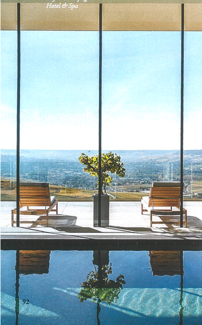
Drink in the views of vineyards at the chic wine-country retreat Royal Champagne Hotel & Spa